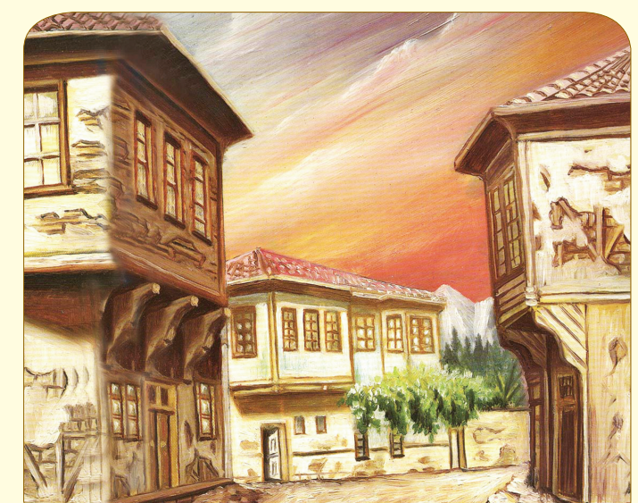
The house he stayed in Kastamonu

c) Kastamonu Lahikası (Kastamonu Addendum) and 1st and 2nd Şua(Rays) were written.