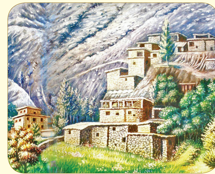
The Village of Nurs