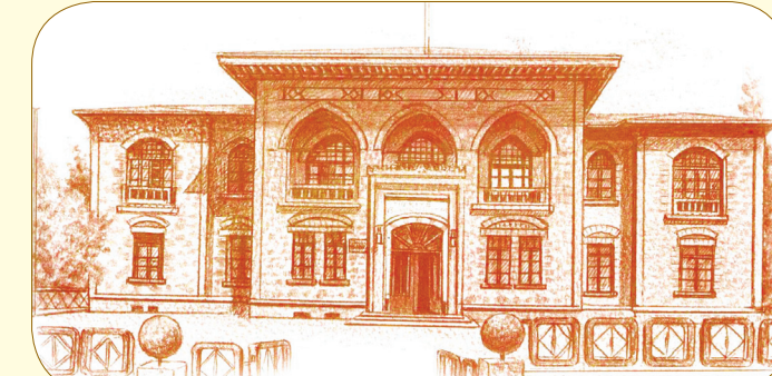
Turkish National Grand Assembly Building, Ankara