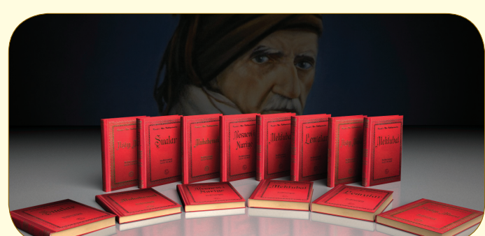
All works of Badiuzzaman: The Risale-i Nur Collection