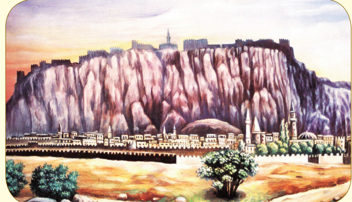
Old city of Van

c) Molla Said continued to memorize books; he memorized approximately ninety books such as " Sharh-ul Mawaqif ", " Sharh-ul Maqasid " during the years he was in Van and he went through the entire list reciting each book by heart once every three months.