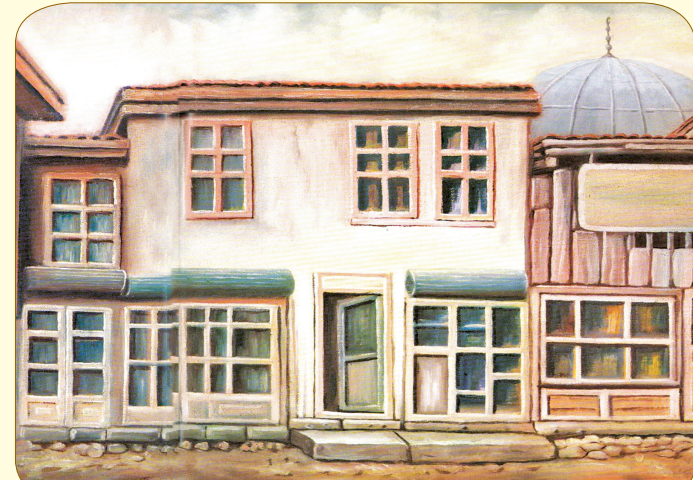
The house he stayed in Afyon