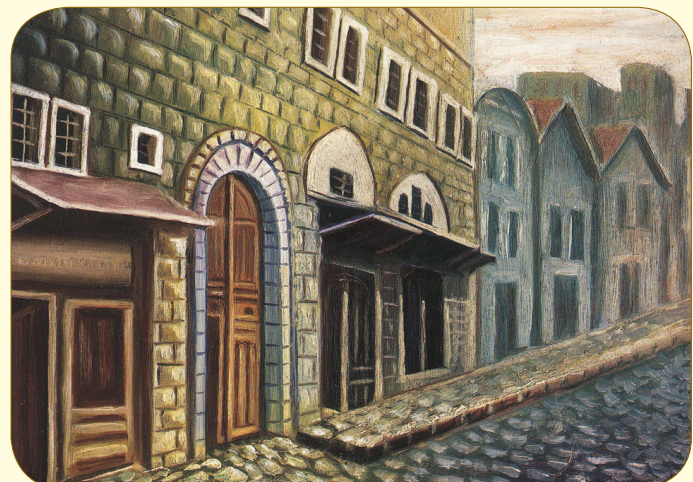
The 'Sekerci Han', Fatih

His first works called " Talikat " and " Kızıl İcaz " were put down on paper.