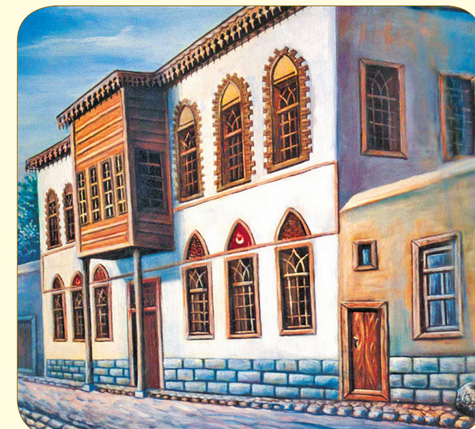
Tahir Pasha Residence, Van